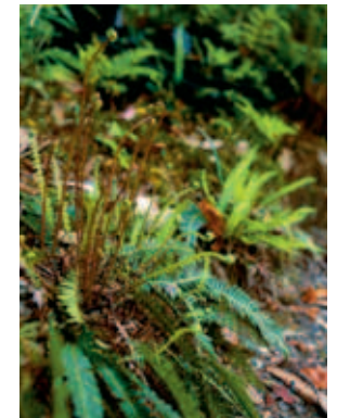
PREVIOUS PAGES, FROM LEFT: ASPLENIUM SCOLOPENDRIUM 'CRISTATUM'. BLECHNUM SPICANT . OPPOSITE, FROM LEFT: DRYOPTERIS CYCADINA . ADIANTUM PEDATUM . THIS PAGE, TOP (L-R): ATTADALE HOUSE. CANDELABRA PRIMULAS. MIDDLE (L-R): TRACHCARPUS FORTUNEI . BLECHNUM SPICANT . BOTTOM (L-R): DRYOPTERIS AFFINIS CRISPA GROUP. ATHYRIUM FELIX-FEMINA .

Ferns have always been an integral part of the gardens at Attadale on the south shores of Loch Carron in north-west Scotland. Since the 1890s a succession of enthusiastic owners have developed and refined the 20 acres of mixed gardens at the heart of this extensive Highland estate, where paying visitors can appreciate the fruits of their efforts. But despite Attadale's vegetable garden, sculpture collection and sunken garden, the importance of the magnificent setting and its native flora, has always been respected.